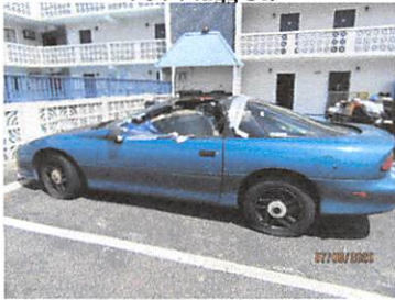
701 Flagg St.