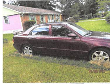
1104 Washington St.