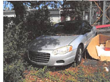
400 N Kings Hwy