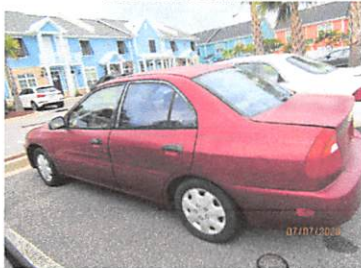
780 Gabreski Ln