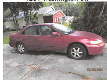
1201 Washington St.