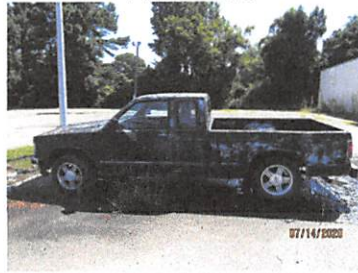
1102 3 rd Ave