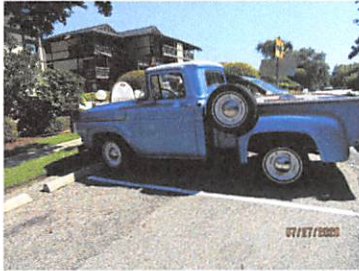
6921 Porcher Dr.