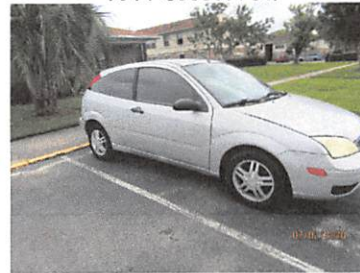
1011 Osceola St.