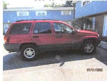
808 65 th Ave N

THE CONSTRUCTION SERVICES DEPARTMENT, CODE ENFORCEMENT DIVISION HAS TAGGED THE FOLLOWING VEHICLES IN ACCORDANCE WITH ARTICLE 41, CHAPTER 5 TITLE 56 OF THE S.C. CODE OF LAWS. SEVEN DAYS HAVE ELAPSED SINCE TAGGING AND THE VEHICLES HAVE NOT BEEN REMOVED. THIS FORM IS FORWARDED TO THE POLICE DEPARTMENT FOR FURTHER ENFORCEMENT ACTION AND DISPOSITION.