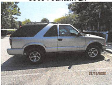
3565 Fountain Ln