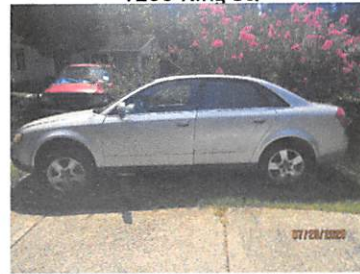
1200 King St.