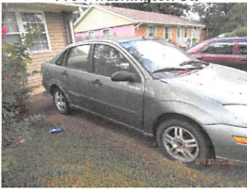
1104 Washington St.