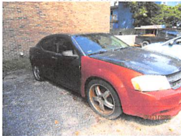
403 76 th Ave N