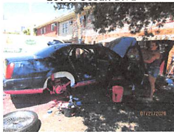
209 N Ocean Blvd