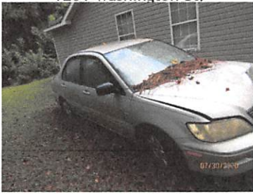
1201 Washington St.