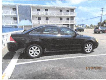
701 Flagg St.