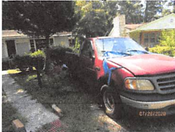
1200 King St.