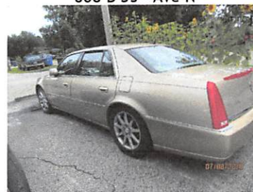
608 B 35 th Ave N