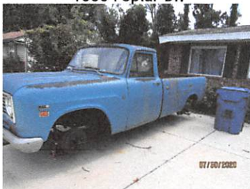
1000 Poplar Dr.